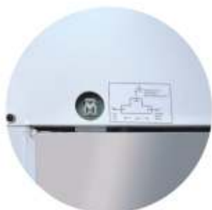
Potential free output for remote alarm