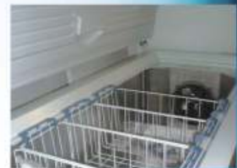
EHF 400/30/AF: inner view