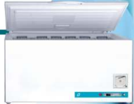
EHF 440/30 with optional chart recorder