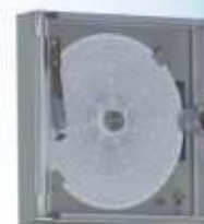
Optional: Chart Recorder