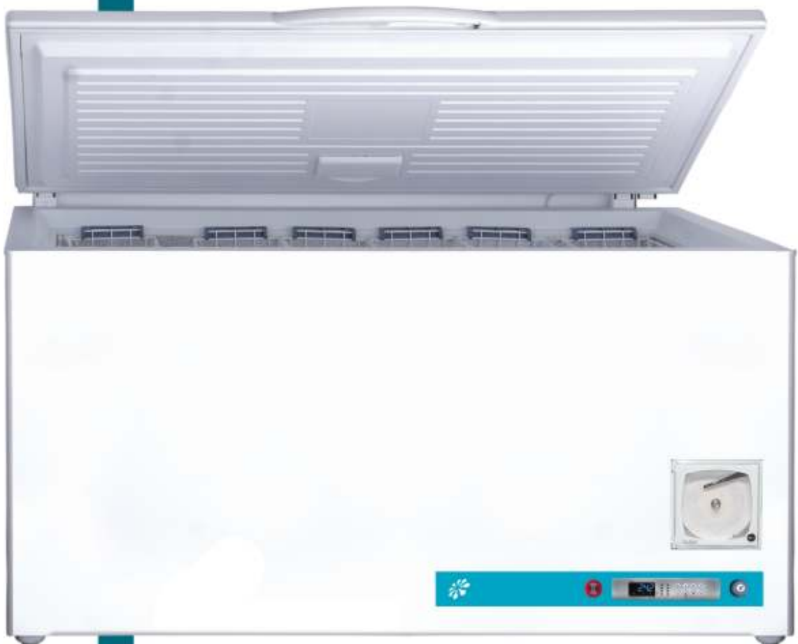
CHF 440/30 with optional chart recorder

PROFESSIONAL LABORATORY CHEST LOW TEMPERATURE FREEZERS MODELS EHF UNTIL -30^{\circ} C