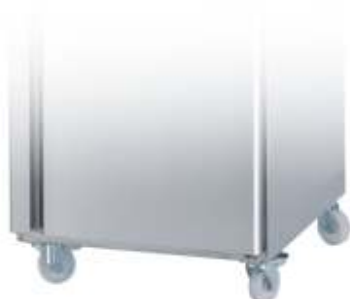
Optional: Base with 4 castors, for easy movement.